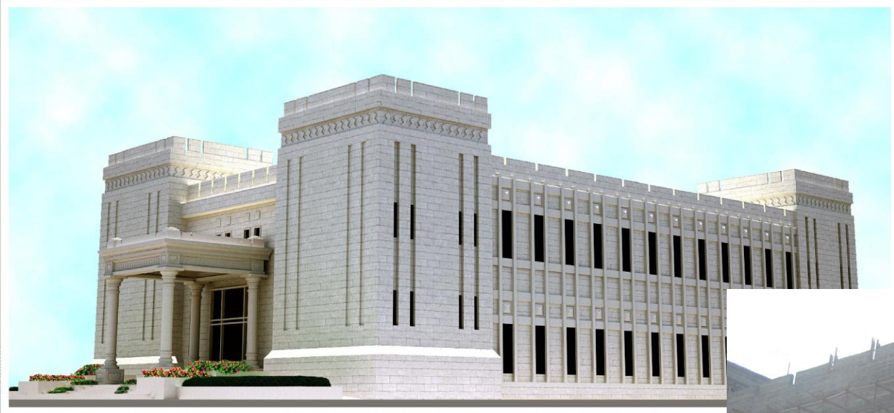
PSD - COMMAND AND CONTROL CENTER